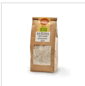
BIO Rye wholegrain flour

Product group Cereals and cereal preparations Product subgroup Flour, Rye Product code 1105 10 00 Product line