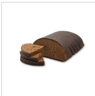
BIO wholegrain rye flour 60%, natural yeast (BIO rye flour, water), BIO sugar, BIO rye malt, BIO cumin, salt

Product group Cereals and cereal preparations Product subgroup Bread, Rye bread Product code 1905 Product line