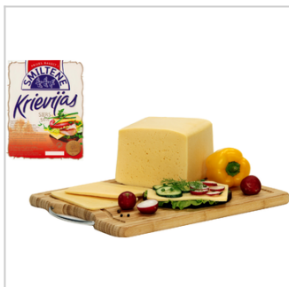
Semi-hard cheese, fat 50%

Product group Dairy products and eggs Product subgroup Cheese, Semi-hard cheese Product code 0406 90 Product line