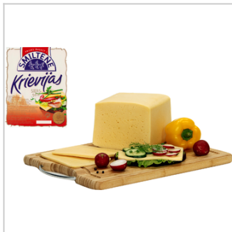
Semi-hard cheese, fat 50%

Product group Dairy products and eggs Product subgroup Cheese, Semi-hard cheese Product code 0406 90 Product line