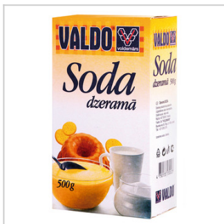
Baking soda 500g

Product group Condiments Product subgroup Seasoning Product code 2836 30 00 Product line VALDO