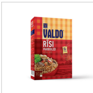
Rice parboiled 1kg

Product group Cereals and cereal preparations Product subgroup Groats & meals, Rice Product code 1006 Product line