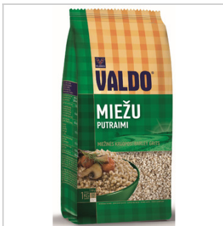
Barley groats 1kg, 500g, 3kg, 5kg

Product group Cereals and cereal preparations Product subgroup Groats & meals, Barley Product code 1003 Product line VALDO