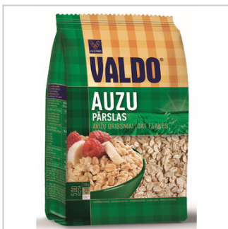
Oat flakes 500g, 3kg

Product group Cereals and cereal preparations Product subgroup Flakes Product code 1103 Product line VALDO