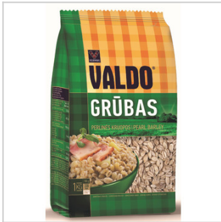
Pearl barley 500g, 1kg, 3kg, 5kg

Product group Cereals and cereal preparations Product subgroup Groats & meals, Pearl-barley Product code 1003 Product line