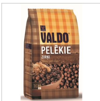
Gray Latvian peas 1 kg

Product group Cereals and cereal preparations Product subgroup Groats & meals, Other Product code 0713 10 Product line VALDO