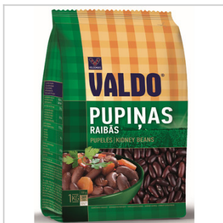
Dark red beans 1 kg

Product group Cereals and cereal preparations Product subgroup Groats & meals, Other Product code 0710 80 Product line