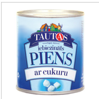
Canned condensed milk with sugar, w/o sugar/ with cocoa / boiled /with coffee

Product group Dairy products and eggs Product subgroup Fresh milk products, Milk Product code 0402 99 Product line