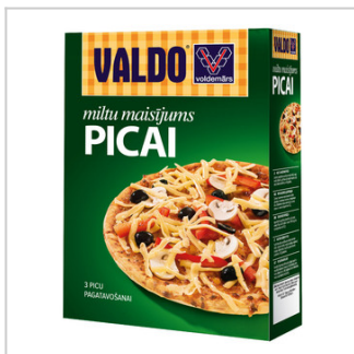
Flour mixtures for Pica, Pancakes, potato pankaces, muffins waffles 300g-400g

Product group Cereals and cereal preparations Product subgroup Flour, Flour mixes Product code 1901 20 00 Product line VALDO