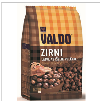
Extra large Latvian gray peas 1kg, 500g

Product group Cereals and cereal preparations Product subgroup Groats & meals, Other Product code 0713 10 Product line VALDO