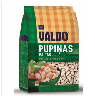
White beans 1 kg

Product group Cereals and cereal preparations Product subgroup Groats & meals, Other Product code 0713 90 00 Product line VALDO