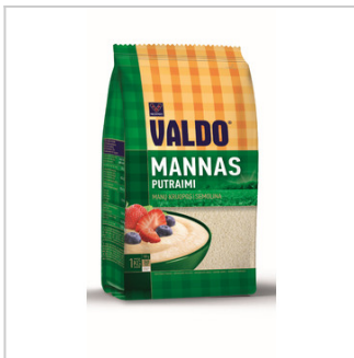
Semolina 1 kg , 500g

Product group Cereals and cereal preparations Product subgroup Groats & meals, Semolina Product code 1103 Product line