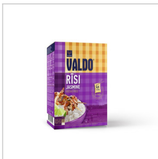
Jasmine rice 4*125g cooking bags

Product group Cereals and cereal preparations Product subgroup Groats & meals, Rice Product code 1006 Product line VALDO