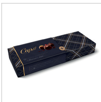
CAPS! Truffle Collection Dark

Product group Confectionery & Cocoa preparations Product subgroup Chocolate and other food preparations containing cocoa, Truffle Product code 1806 90 Product line