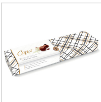
CAPS! Truffle Collection Milk

Product group Confectionery & Cocoa preparations Product subgroup Chocolate and other food preparations containing cocoa, Truffle Product code 1806 90 Product line