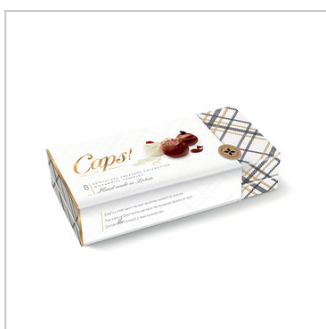
CAPS! Truffle Collection Milk

Product group Confectionery & Cocoa preparations Product subgroup Chocolate and other food preparations containing cocoa, Truffle Product code 1806 90 Product line