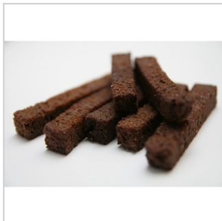
Rye bread, oil, garlic, salt

Product group Cereals and cereal preparations Product subgroup Pastrycooks' products Product code 1905 Product line