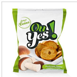
Baked bread snacks

Product group Cereals and cereal preparations Product subgroup Pastrycooks' products Product code 1905 40 10 Product line OU YES