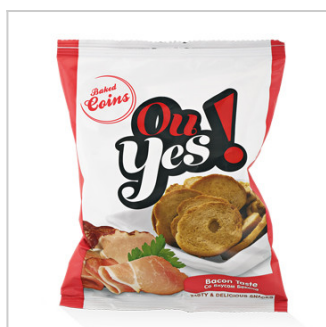
Baked bread snacks

Product group Cereals and cereal preparations Product subgroup Pastrycooks' products Product code 1905 40 10 Product line OU YES