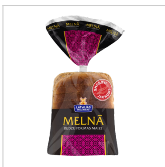
Shaped black rye bread, sliced

Product group Cereals and cereal preparations Product subgroup Bread, Rye bread Product code 1905 Product line Melnā