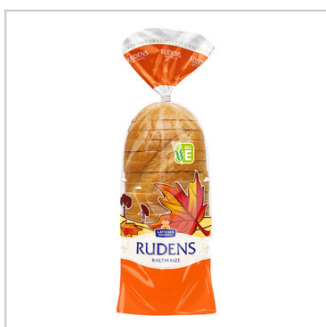
White bread, sliced

Product group Cereals and cereal preparations Product subgroup Bread, Wheat bread Product code 1905 Product line Rudens