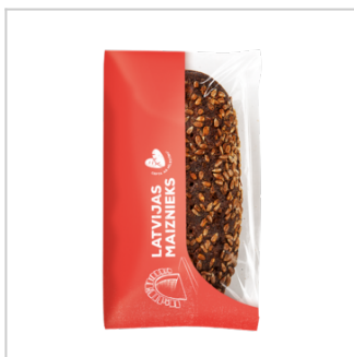
Frozen sour-sweet bread with grains

Product group Cereals and cereal preparations Product subgroup Bread, Bread with seeds, nuts, fruit etc. Product code 1905 Product line