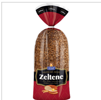
Sour-sweet bread, sliced

Product group Cereals and cereal preparations Product subgroup Bread, Mixed flour bread Product code 1905 Product line Zeltene