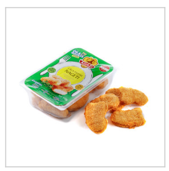
Fully cooked crispy nuggets

Product group Meat and meat products Product subgroup Fresh, chilled meat, Chicken Product code 1601 00 Product line ČIK UN GATAVS