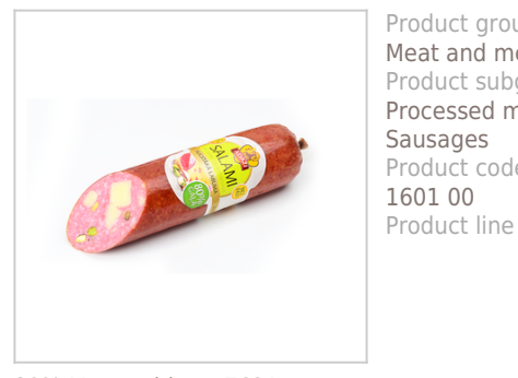
80% Meat, without E621

Product weight NET 900 Gram (g) Product group Meat and meat products Storage terms (days) 40 Product subgroup Storage temperature min (C) 2 Processed meat products, Storage temperature max (C) 6 Sausages Product code Storage conditions Dry and cool place