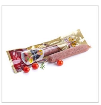
Without gluten, without Soy

Product group Meat and meat products Product subgroup Processed meat products, Sausages Product code 1601 00 Product line