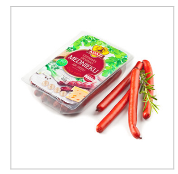
80% Meat, without E621

Product group Meat and meat products Product subgroup Processed meat products, Sausages Product code 1601 00 Product line